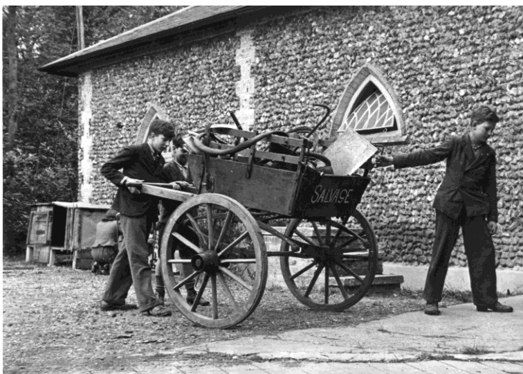
Bringing in salvage for COG Scheme in Thurston 1939-1945, 1939-1945.

These talks proved to be highly successful, as salvage collections in every borough began to increase significantly. After these early accomplishments, the WVS introduced rewards to continue to encourage children to help with the collections. For example, badges representing a cog-wheel was an excellent way of rewarding the most enthusiastic children. Over a three year period, 192,523 badges were issued to deserving members. 63 This was also a superb way of stimulating further interest in the scheme.