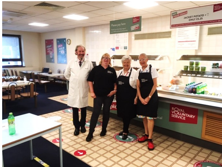
Royal Voluntary Service Canteen, Norwich Combined Courts. Opened 2 nd September 2020. WRVS20200010.

Almost fifteen years to the month later, in September 2020, Royal Voluntary Service (RVS) would open the first of a new breed of court canteens. The new modern canteens were opened in Norwich Combined Courts and Southend Combined Courts.