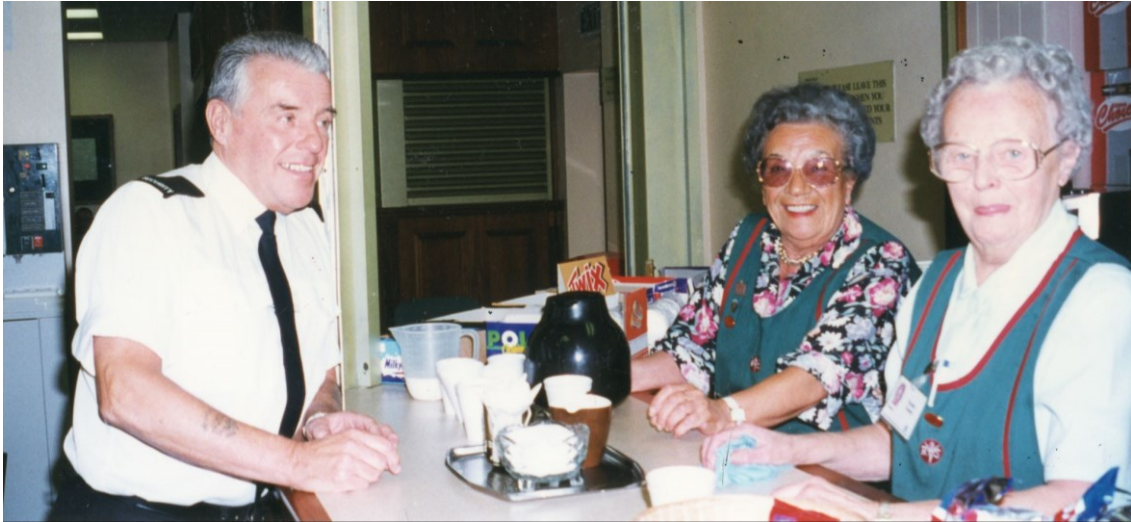
WRVS Members staffing the Wakefield Magistrates Court Canteen in the late 1990s. It was one of the last to close in 2005. WRVS/HQ/PBY/MKTPPRIS/CCAN001. Unknown Copyright

Between 2002 and 2005 all of the court canteens along with prison canteens, child contact centres and toy libraries were either closed, transferred to other bodies or set up as their own independent charities 6 .