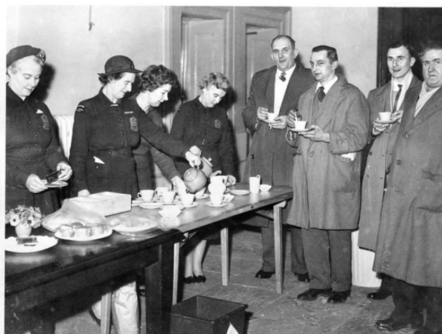
Members of the Derby WVS Food Flying Squad, provide refreshment at the Derby Assizes 17 th February 1961. WRVS/HQ/P/PRIS/CAN001. Unknown Copyright

Court canteens were a relatively late addition with humble origins, the first recorded instance of the WVS serving refreshments at courts was for the Derby Assizes and Quarter sessions in 1961. Members of the WVS Food Flying Squad, who were trained to feed thousands in the event of a nuclear holocaust, were asked to provide 'tea, coffee, and light refreshments' 1 for the