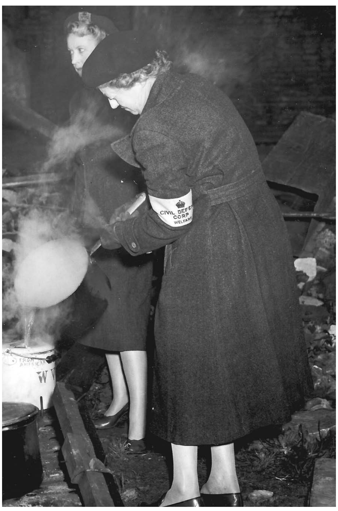
Showing a wartime uniform tweed overcoat, note the button and tab on the sleeve (The Civil Defence Corps Armband is 1950's)