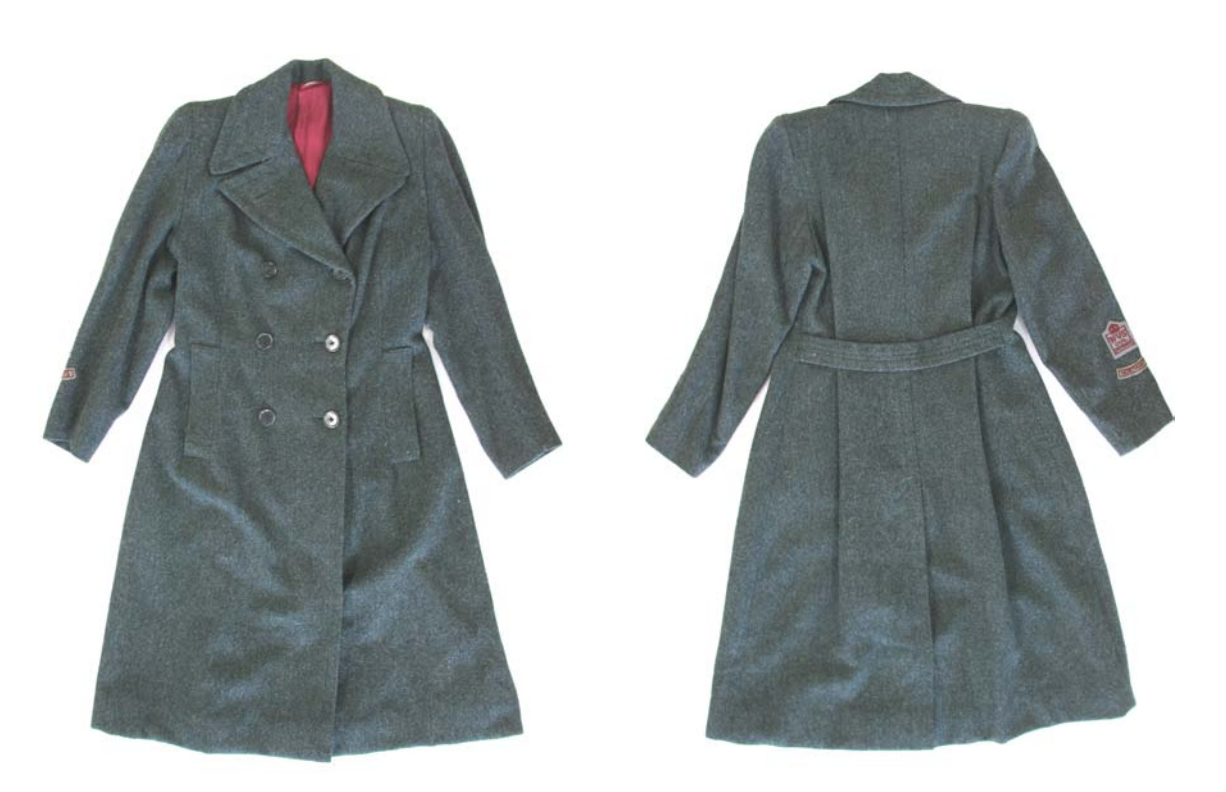
A 1950's Tweed overcoat front and rear, these were almost identicle to those produced during the war apart from the loss of the sleeve tabs and the colour of the lining.

Produced in a heavy tweed material in which green and grey were interwoven in a herringbone effect and fully lined in artificial silk (the colour is not known). Double breasted with 6 large buttons to the front with an additional small hidden button and tab to secure the bottom of the coat. Two large pockets at waist level with vertical openings. At the back there is a yolk and below two un-pressed pleats, held in place with a half belt and a split which runs approximately half way to the waist, also secured with a small button. The shoulders are padded. There are tabs on each sleeve, approximately 1 ½ inches from the cuff and approximately 2 inches wide, secured with a single button, the ends pointing outward/back. Some wartime uniform overcoats and suits have epaulets but these were sold separately and attached by members. Produced in Regular, Short and X Hip sizes with Regular overcoats ranging between, Bust, Hip and Length sizes of 33-36-43 to 41-45-49. Later produced in large sizes, the largest of which is noted above.