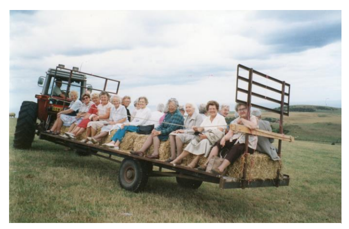
York Association members enjoy a visit