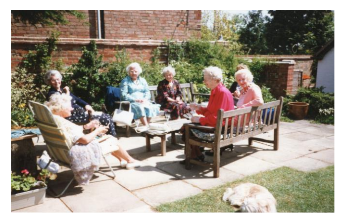
Meeting of members of the Warwickshire Branch 22/05/1990

The WVS/WRVS Association has to charge for its membership as it received limited support from the WRVS through the payment of the rent, electricity and telephone bills of the Association's office. At the first annual meeting it was decided that the subscription for membership would be £1 annually, of which 50p contributed to the WRVS Magazine, with life membership being £10.