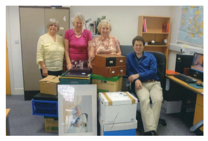
The WRVS Association Archive material being collected by the Archivist.

The WRVS funding of the Association was to cease after 2011, and although the Association felt it could potentially last up to two years without this support, it was decided to hold a secret ballot at the AGM to decide the Associations fate. There were declining membership numbers due to the death of members and the resignation of others for various reasons such as ill health and going in to care, with very few new members joining.