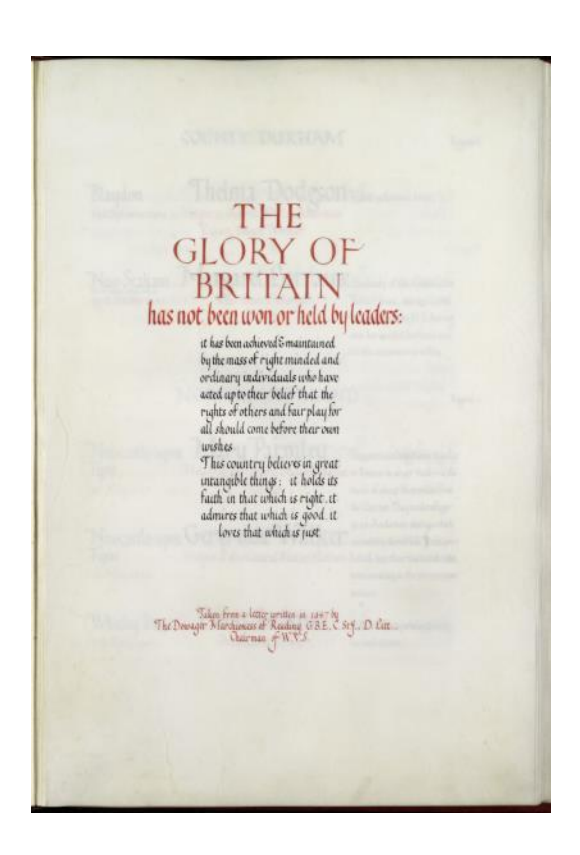
Pages from the Roll of Honour