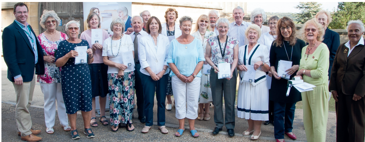
Royal Voluntary Service volunteers receiving long service awards at Lancing, West Sussex.

Although our volunteers give their time selflessly, we still depend on funds to recruit, train and manage these volunteers, and to run many of our vital services.