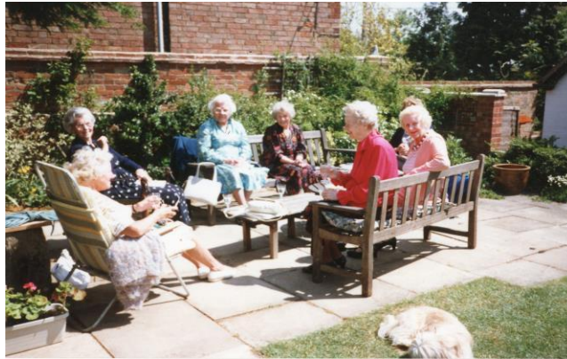
Meeting of members of the Warwickshire Branch 22 May 1990

Once the WRVS Magazine was discontinued in December 1974 the Association began to produce its own newsletter which had to be self-funded. It was the cost of producing and distributing this publication, along with the increase in postage and general costs that took a considerable amount of the membership fees and led the Association to continue to increase membership costs.