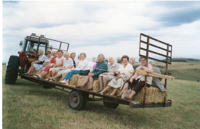
York Association members enjoy a visit to a farm