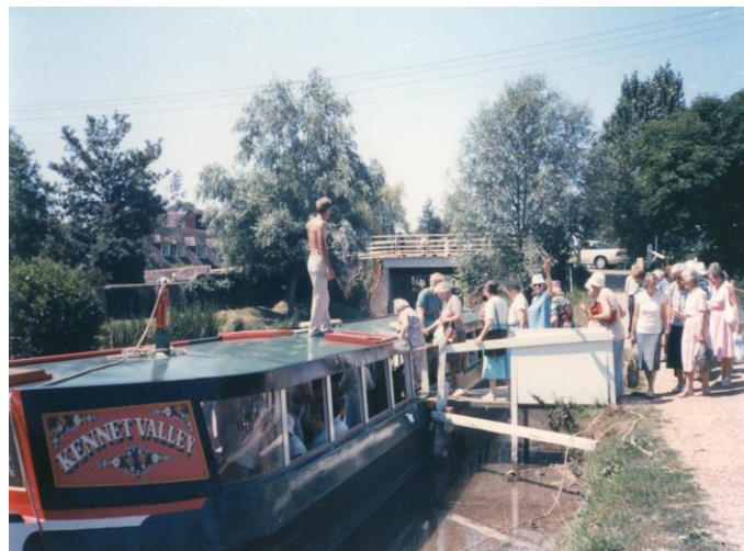
York Association members boarding a barge on Kennet and Avon Canal, July 1990