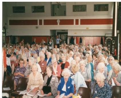
Members attending the AGM in York, 1990